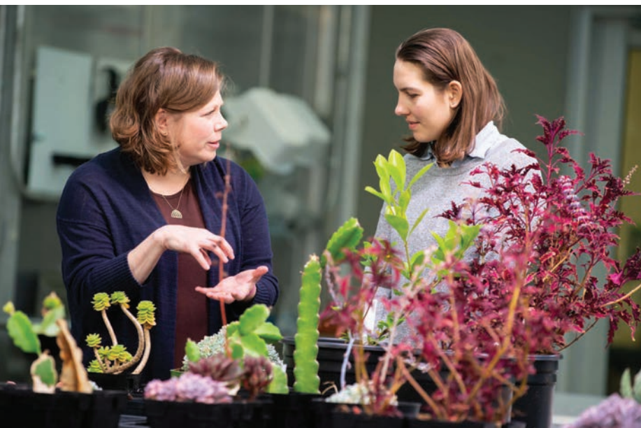
Metro State University (MN)

The GROW-IT Center, located on Metro State University's St. Paul campus, conducts applied research to meet the needs of traditionally underserved partners and local food producers, while contributing to the national discourse on issues related to agriculture, food, and sustainability. Serving as a hub for community-university learning and exchange on urban food production, healthy food access, and environmental restoration, the GROW-IT Center addresses multiple facets of food security and highlights the significance of cultivating and distributing culturally based foods and medicines. By tying research into a collaborative space for community partners, the GROW-IT Center redefines innovation, teaching, and workforce development and can increase education opportunities and strengthen the wider community.