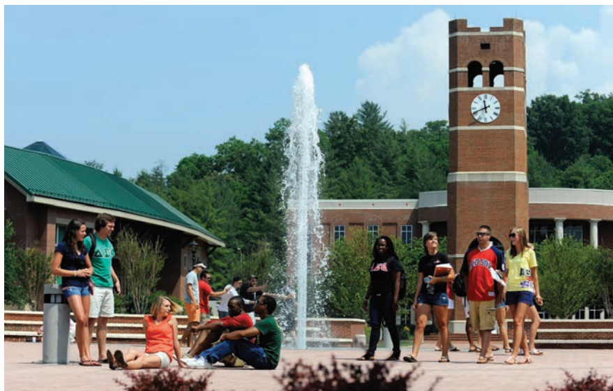
Western Carolina University (NC)

infrastructure and public health of communities, particularly in the post-pandemic recovery. In some instances, this includes helping fill gaps in health care services due to shortages of providers or spillover effects from the erosion of social services. For example, rural communities where manufacturers closed operations have also experienced hospital closures, causing doctors to leave the region. Some institutions have developed programs specifically to train health care workers who plan to stay in the region and offer instructional clinics where students can practice techniques and the community receives low-cost