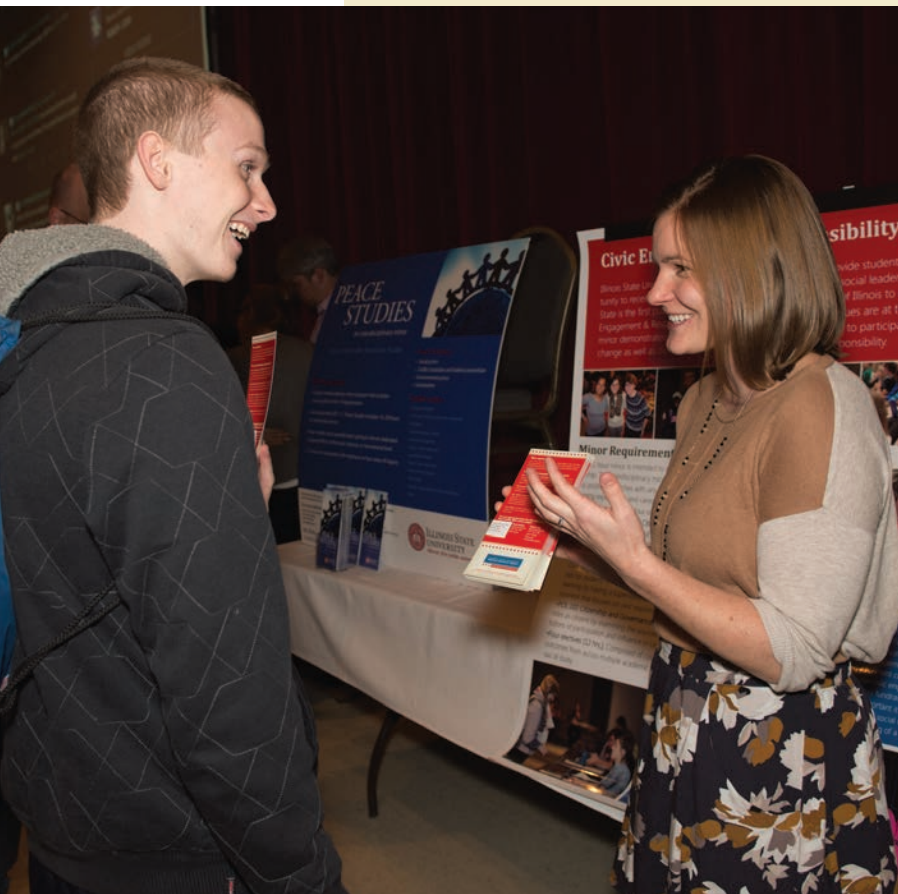
Illinois State University

about 71% voter turnout, with 1,102 students utilizing TurboVote and 1,700 people using campus polling places to vote early.