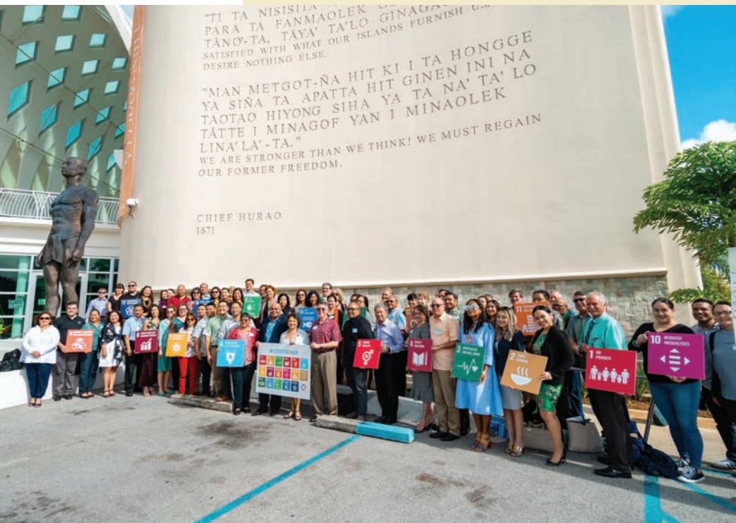
University of Guam

G3 has sourced more than $1.5 million to implement sustainable development projects and programs to maximize deliverables, interest, and long-term sustainability. The working group members developed a plan representing 82 organizations and agencies that includes 122 goals, 225 objectives, 414 action items, and 263 metrics to track progress.