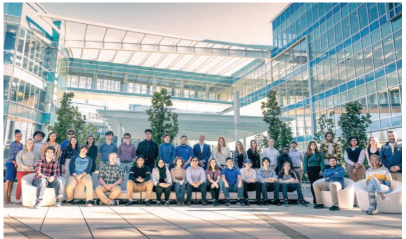
East Tennessee State University

Stewardship of place entails taking seriously the role of RCUs in spurring regional economic development and, in some cases, community revitalization. An important element of this responsibility is workforce development and being responsive to the needs of the local labor market—matching degree offerings to the needs of regional employers. Although fields such as teaching and health care are often front and center in conversations about responding to regional labor market needs, stewardship of place also means attending to new and emerging industries whose success may depend on a campus partner to provide workforce development. This might entail developing new academic programs, as well as nondegree training and certificate programs in collaboration with companies. These collaborations can be mutually beneficial—a key principle of stewardship—in that they could create internship and cocurricular opportunities for students while helping companies meet their workforce goals. Many RCUs are also heavily