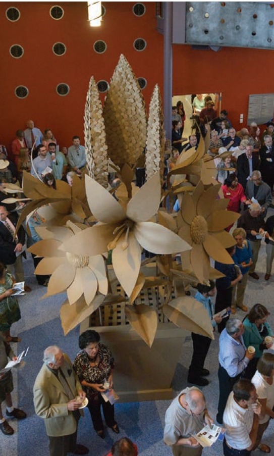
Western Connecticut State University