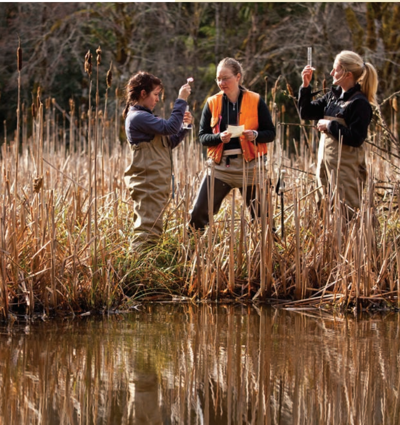
Portland State University (OR)