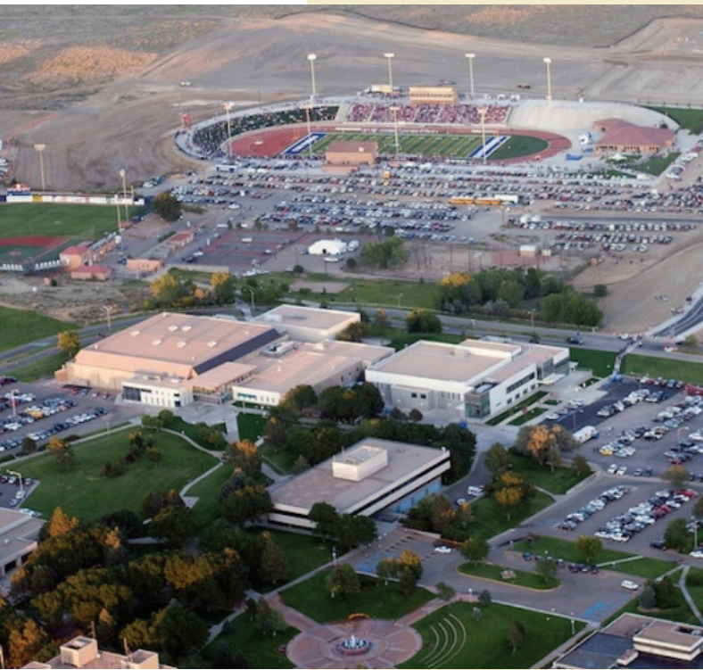
Colorado State University Pueblo

colleges that help create access points and prepare students for subsequent study only bolster the mission of RCUs. Many community college students desire to pursue a bachelor's degree, and stewardship of place means facilitating their seamless transfer into RCUs and supporting their success once enrolled. Some RCUs host student transfer offices and others maintain articulation agreements with area community colleges that can ease this process for students.